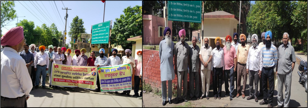
Red Cross Drug De-addiction and Rehabilitation Centre Kurali, Punjab organized awareness rally under "Nash Mukta Bharat Abhiyaan in Rupnagar in favour of May day