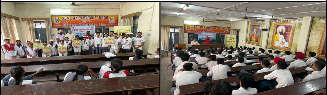
Red Cross Drug De-addiction and Rehabilitation Centre, Patiala, Punjab organized awareness session at SDSE Senior Secondary School, Patiala