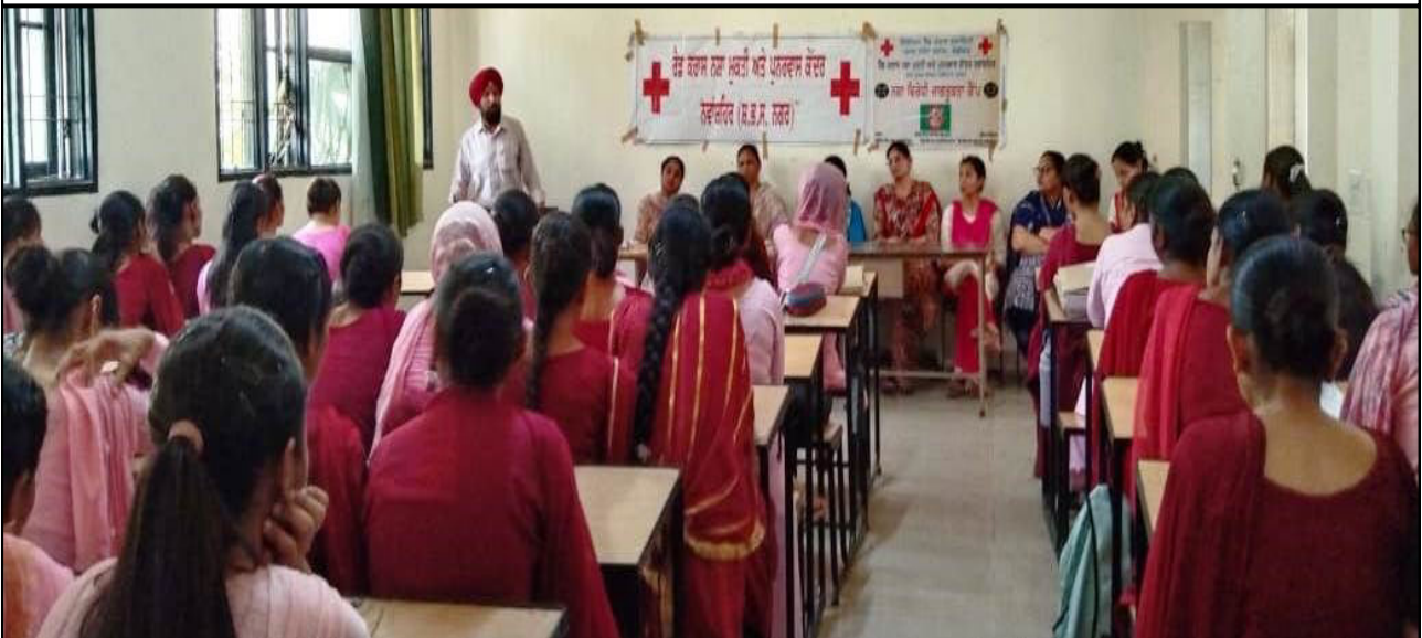
Red Cross Drug De-addiction and Rehabilitation Centre, Nawasheher, Punjab organized awareness session at Government Industrial Training Institute Nawanshahr