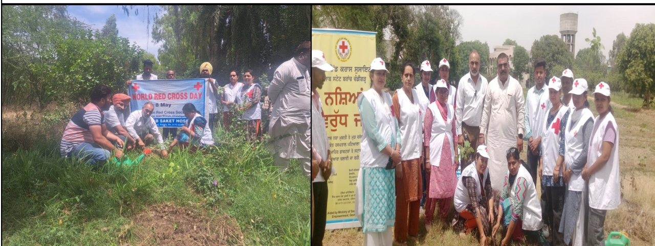
Red Cross Drug De-addiction and Rehabilitation Centre, Patiala, Punjab organized plantation activity at different environmental parks to reduce pollution.