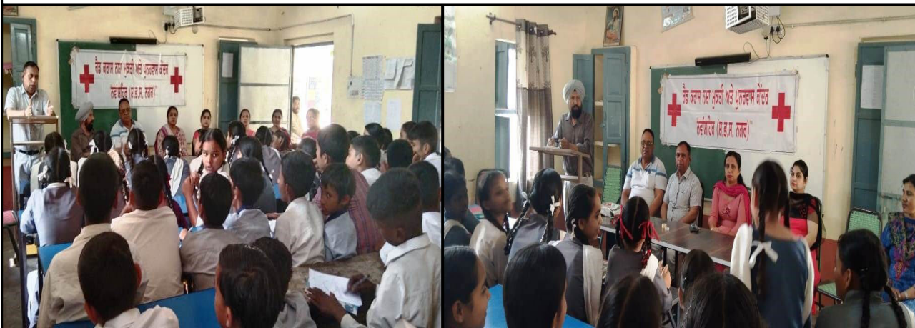
Red Cross Drug De-addiction and Rehabilitation Centre, Nawasheher, Punjab organized awareness session at Government High School, Bhin Nawasheher