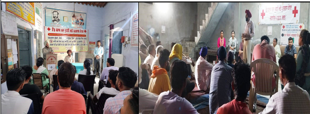
Red Cross Drug De-addiction and Rehabilitation Centre, Nawasheher, Punjab organized awareness session on the occasion of World No Tobacco Day.